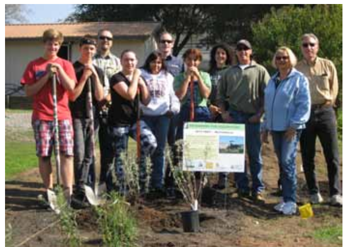
Placer County RCD was honored by NRCS this year as one of four Outstanding Districts of the Year for the Placer County Hedgerow Program, an effort to raise awareness about the value of native pollinators within the central Sierra foothills. The Placer County Hedgerow Program serves to connect technology, education, and local communities/landowners to help build native pollinator habitat and contribute to the central Sierra foothill’s sustainable agriculture future.