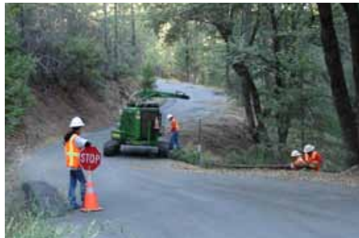
Placer Co RCD recently completed the Dutch Flat/ Alta Bark Beetle Prevention Project, to the benefit of more than 100 landowners and 80 acres.

In California, there are currently 103 RCDs that manage a range of resource conservation projects, including soil, water, wildlife habitat, exotic plant control, conservation planning, education, and more.