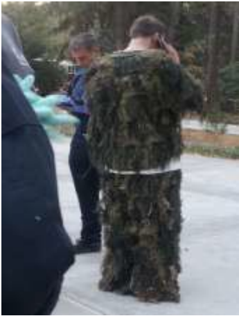
Altair drunk intruder with police